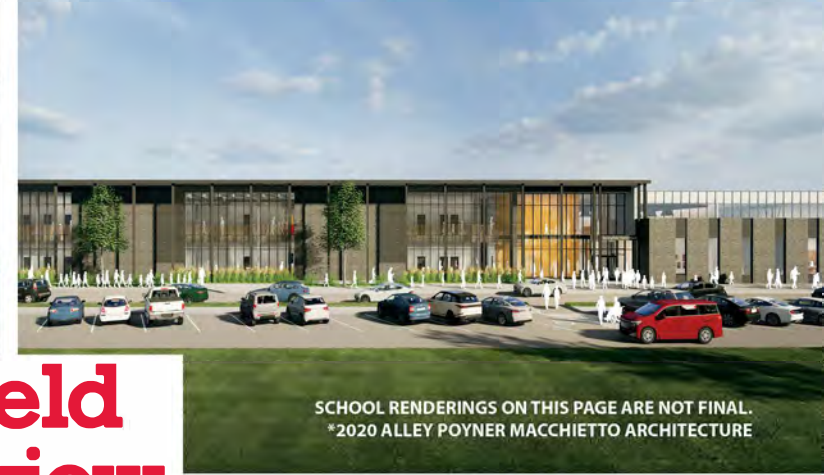
SCHOOL RENDERINGS ON THIS PAGE ARE NOT FINAL. *2020 ALLEY POYNER MACCHIETTO ARCHITECTURE