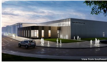
View from Southeast