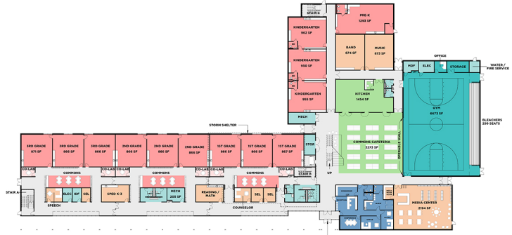
FLOOR PLAN - LEVEL 1