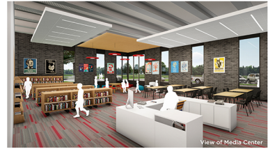
View of Media Center