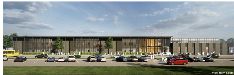
View from South