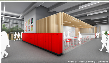
View of Pod Learning Commons