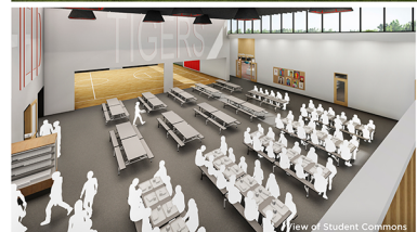
View of Student Commons