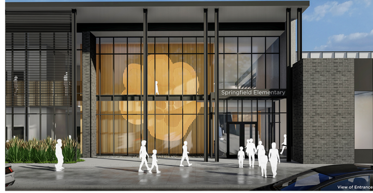
View of Entrance