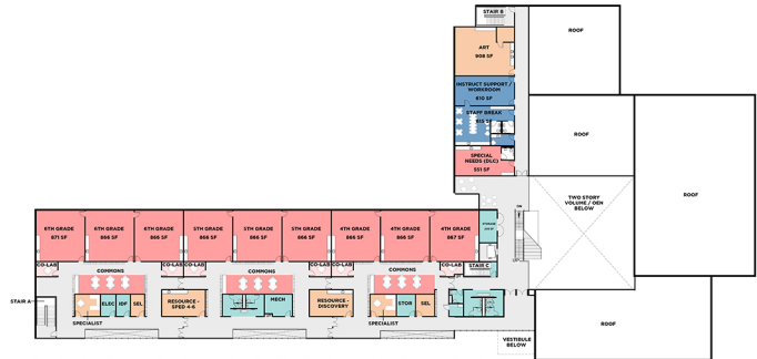
FLOOR PLAN - LEVEL 2